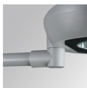
Product code: 9600333 Description: NIU ACC. TO LIGHTING POLE Ø 48MM 9600343 NIU ACC. TO LIGHTING POLE Ø 60MM