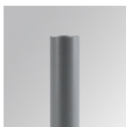
Product code: 9635873 Description: CONICAL COLUMN 4M V2010 GREY 9636873 CONICAL COLUMN 6M V2010 GREY 9637873 CONICAL COLUMN 8M V2010 GREY 9638873 CONICAL COLUMN 10M V2010 GREY