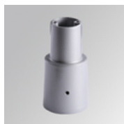
Product code: 9600353 Description: NIU ACC. COLUMN ADAPTER Ø76MM