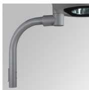
Product code: 9600363 Description: NIU ACC. WALL SUPPORT