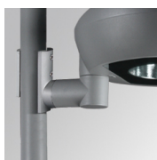
Product code: 9600323 Description: NIU ACC. ANCHORAGE COLUMN Ø60-135MM