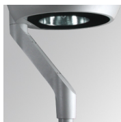
Product code: 9600313 Description: NIU ACC. INDIV. POST-TOP ARM Ø60MM