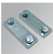
Product code: 6507420 Description: INTERMEDIATE JOINT MOD/POL LUM. C L