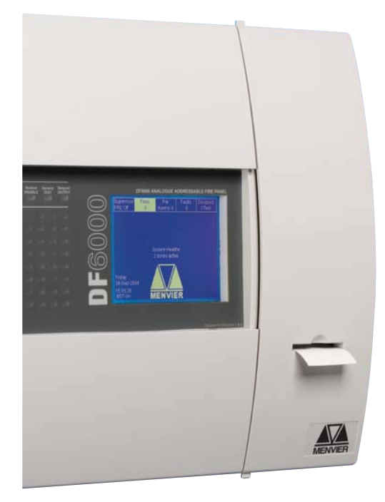
DF6000 control panel with printer