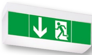
51021 CG-S with pictogram foil