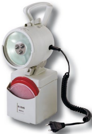
W 276.3/4 LED