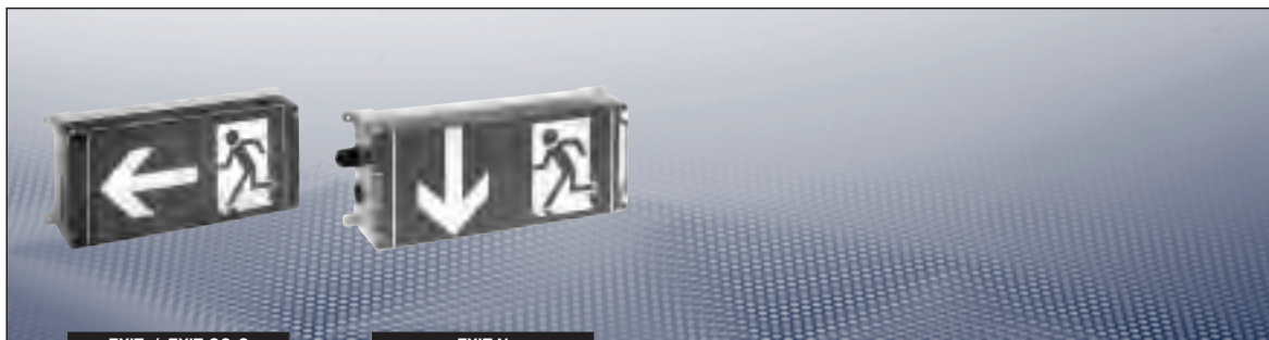
EXIT / EXIT CG-S